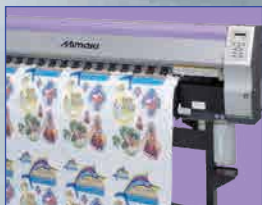
Printing by the JV33 series

Precise contour cutting to make stickers and seals