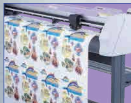
Contour cutting by the CG-FXII series