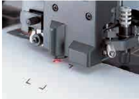
Light pointer easily adjust the head position to crop marks

Plug-in cutting software is included fineCut 8 for Illustrator® for Windows / Macintosh for CoreIDRAW for Windows